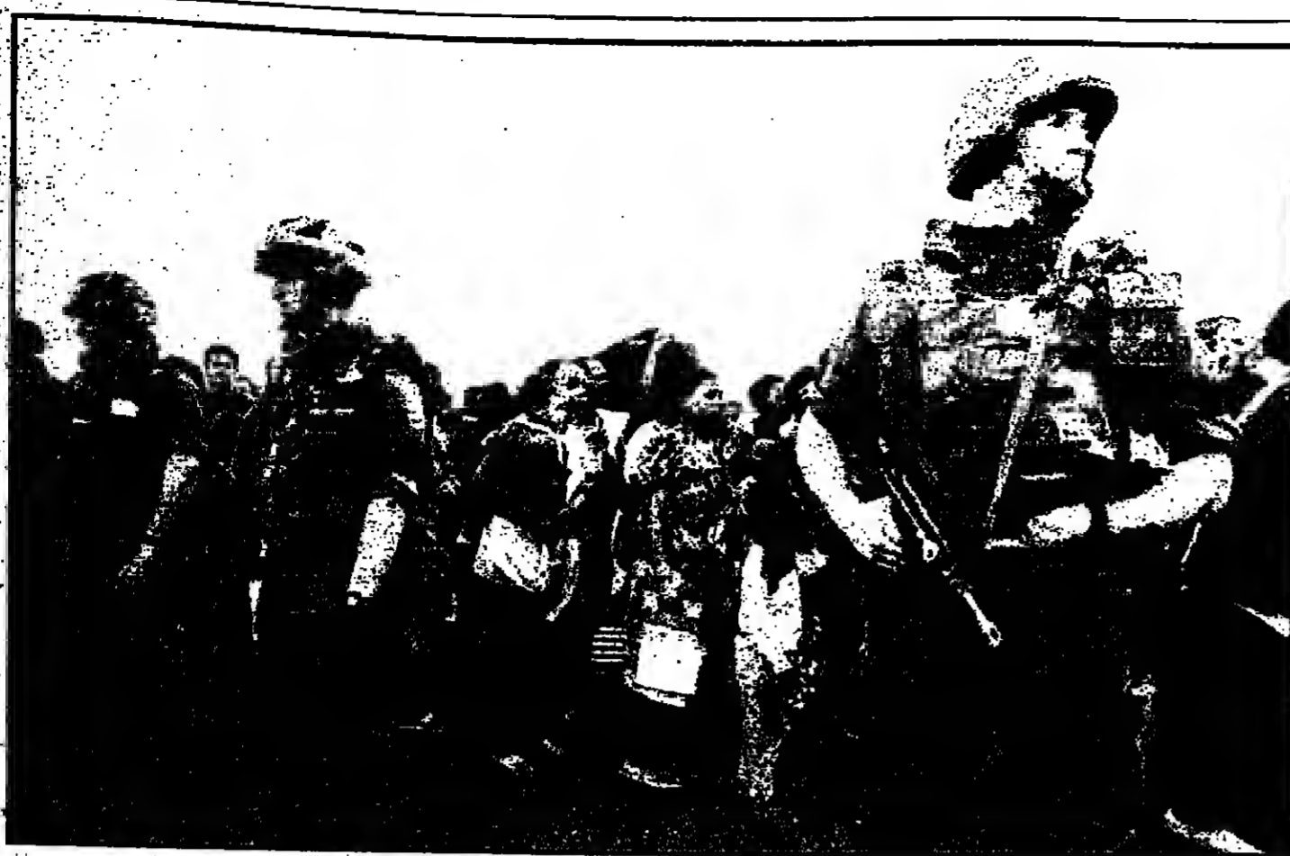
French troops protect French and Congolese nationals near Brazzaville airport yesterday.

French troops ventured into the city to pick up civilians, including many crowded at the French ambassador's residence, and carried them back to the international airport's private Aeroclub.